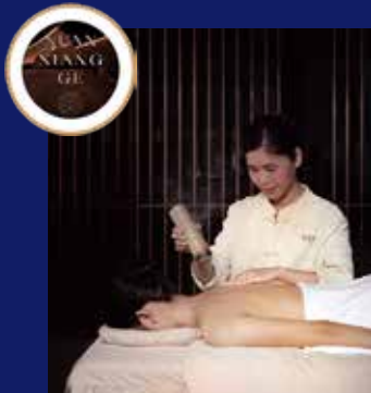
暖香阁 Warm Aroma Pavilion

地址 / Addresss: 深圳市南山区深南大道 9680 号大冲商务中心 A 座 301 号 Room 301, block a, Dachong business center, 9680 Shennan Avenue, Nanshan District, Shenzhen