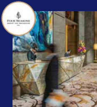
韦尔四季度假酒店 Four Seasons Resort and Residences Vail

地址 / Addresss: 深圳市南山区科苑南路 2888 号深圳湾万象城 L121/L235 L121/L235, MIXC(Shenzhen Bay), 2888 Keyuan Nan Road, Nanshan District, Shenzhen