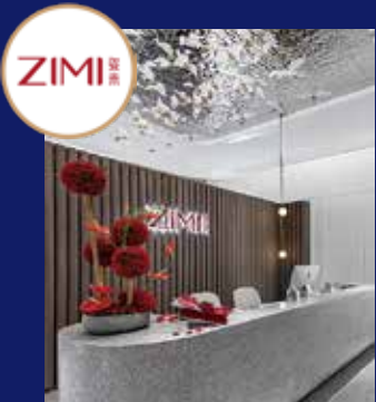
姿米国际 Zi Mi International

地址 / Addresss: 深圳市南山区粤海街道深圳湾 1 号广场南二期二层 212/213 Rm 212/213, South Phase II, 2/F, One Shenzhen Bay, Yuehai St. Nanashan Dist. Shenzhen