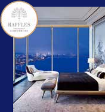
深圳鹏瑞莱佛士酒店 Raffles Shenzhen

地址 / Addresss: 深圳市南山区中心路 3008 号深圳湾壹号 T7 T7, One Shenzhen Bay, 3008 Zhongxin Road, Nanshan District