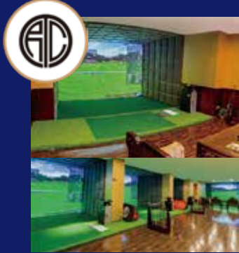
圆桌汇高尔夫俱乐部 Round Table Collection Golf Club

地址 / Addresss: 深圳市南山区中心路 3088 号深圳湾 1 号南区 216 号 No. 216, Southern District, One Shenzhen Bay, No. 3088 Central Road, Nanshan District