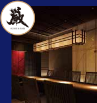
鮨蔵 Sushi Gen

地址 / Addresss: 深圳市南山区中心路 3008 号深圳湾壹号 T7 T7, One Shenzhen Bay, 3008 Zhongxin Road, Nanshan District