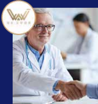
伟航医疗 Wayon Hospital Management Group

地址 / Addresss: 深圳市南山区深圳湾 1 号广场 1 栋 106,206 No.106, 206, Building 1, One Shenzhen Bay, Nanshan District, Shenzhen