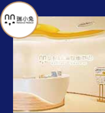
瑞小兔 儿童健康中心 Reliance Medical

地址 / Addresss: 美国科罗拉多州韦尔路 1 号韦尔四季度度假酒店 Four Seasons Resort and Residences Vail, One Vail Road, Vail, Colorado U.S.A