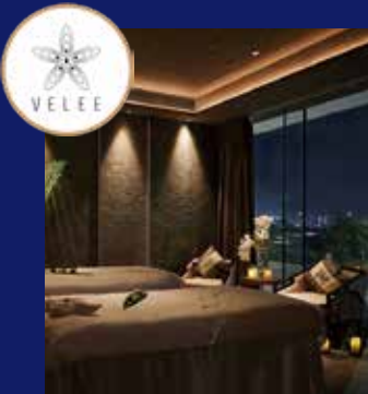
薇妮 SPA Vele SPA

地址 / Addresss: 深圳市南山区侨城坊 T3 栋 4 楼 4/F, building T3, qiaochengfang, Nanshan District, Shenzhen