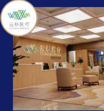
云杉医疗 YUNSHAN MEDICAL

地址 / Addresss: 深圳市南山区中心路与工业八路交汇处颐安海首层 1/F of Yi'an Yuehai, at the intersection of Zhongxin Road and Gongyeba Road, Nanshan District, Shenzhen